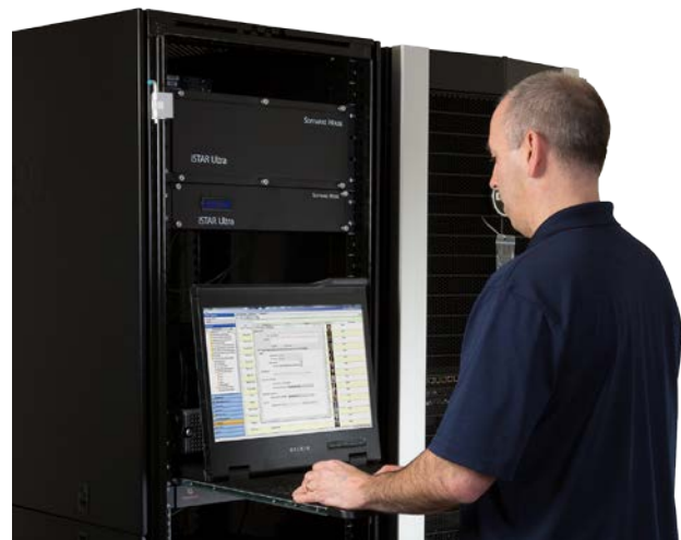
iSTAR Ultra is easy to configure in its convenient rack-mount model

installing a panel on the wall. Separate GCM and ACM modules can be arranged in the rack to optimize your server room installation. For example, the GCM can be mounted in the front of a four-post rack, while the ACM and field wiring can be located in the rear of the rack. Field wiring on the ACM is easily routed through the top and/or bottom of the enclosure, with the ACM board mounted front and center for convenient servicing.