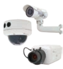
Illustra IP Cameras