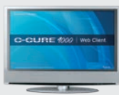
C•CURE 9000 Web Client