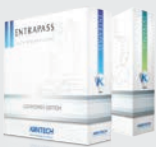
EntraPass CE, GE