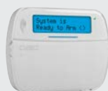
DSC PowerSeries Neo