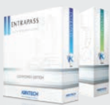
Entrapass Corporate and Global Editions