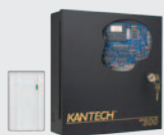
KT-100/KT-300 Door Controllers