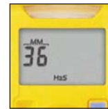
Easy to Read