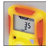
Easy to See