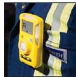
Easy To Wear