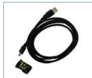
IR connectivity kit