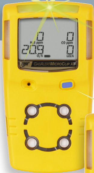
GasAlert MicroClip X3

Guaranteed to run for an entire shift — even in harsh weather.