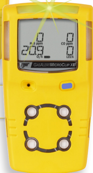
GasAlert MicroClip XL

NEW! GasAlertMicroClip Series now features IP68 for maximum water and dust protection.