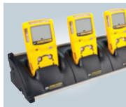
Five unit cradle charger

For a complete list of kits and accessories, please contact BW Technologies by Honeywell.