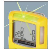
Easy to See