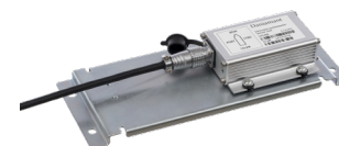
Sensor Unit with mounting plate