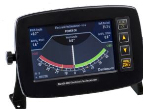
Bracket mounting model