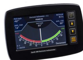
Panel mounting model