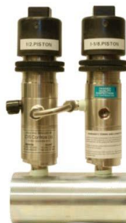
High/Low Pilot Arrangement