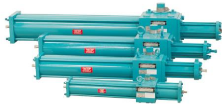
CVS Scotch Yoke Actuators

The CVS D Series actuator is well suited for operating plug, ball, butterfly, dampers and other devices requiring 90° turn rotation. ( \pm 4^{\circ} of additional angle adjustment)