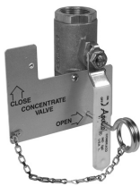
APOLLO CONCENTRATE ISOLATION BALL VALVE 006738