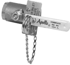
APOLLO 1 WATER INLET BALL VALVE 006739

CHEMGUARD ball valves and swing check valves are available for use with most bladder tank foam systems. All valves are of bronze construction and have NPT connections. The water inlet and concentrate isolation ball valves feature nameplates with their respective name, ring pin, and tamper seal for visually monitoring that the position of the valves are correct.