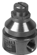
WATTS PRESSURE REDUCING VALVE 006741

The hydraulic concentrate control valve can be used in conjunction with any type of closed-head sprinkler system (wet pipe, dry pipe, and pre-action). It can also be used in open-type deluge systems. To pressurize the valve, the water line is commonly run from the alarm trim of the sprinkler valve (see "Typical Piping Arrangement"). The pressure sensing line to the actuator should be a minimum of 1/4 in. pipe or alternate 3/8 in. tubing (the actual connection to the actuator is 1/8 in. NPT). The actuators are sized to operate with a minimum pressure of 30 psi (2.1 bar). Technical Services should be consulted for applications where the water pressure potentially could be lower. The maximum recommended water pressure to the actuator is 160 psi (11 bar). For higher pressures, a 1/4 in. FM Approved WATTS 1 Pressure Reducing Valve (Part No. 415020) should be installed in the line to the actuator.