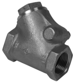
SWING CHECK VALVE 006742