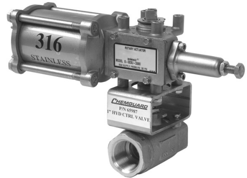
HYDRAULIC CONCENTRATE CONTROL VALVE 009862