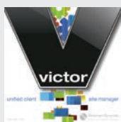
victor Unified Client